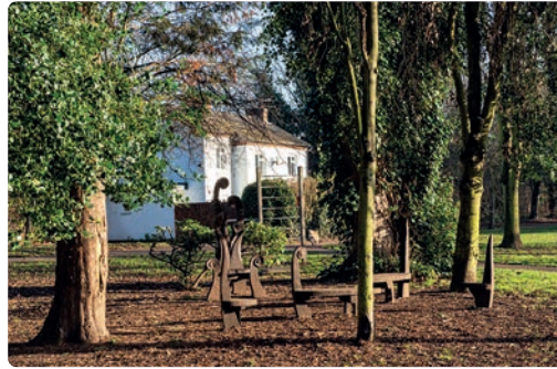
West Bridgford Park